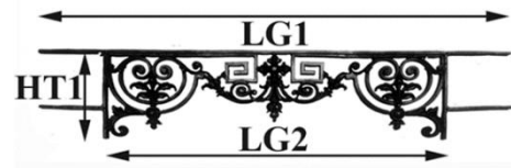
Schéma explicatif dimensionnel