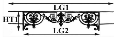
Schéma explicatif dimensionnel